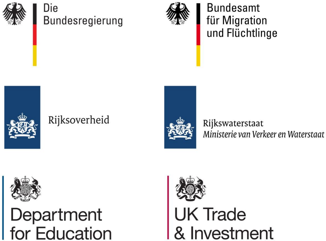
Figure 1. National identity system for German Government (1996), Dutch Government (2006) and United Kingdom Government (2012).

profoundly modify the bureaucratic apparatus, any attempt to simply repaint the façade is irretrievably destined to fail.